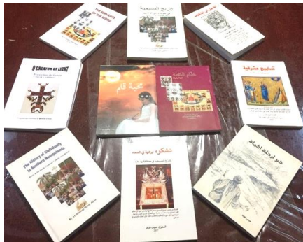
The Diocese Publishing