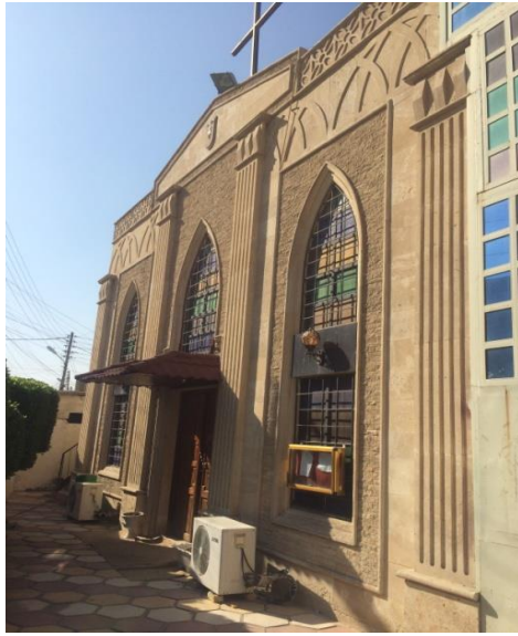
The Church of Saint Ephrem 1969 (Ashar)