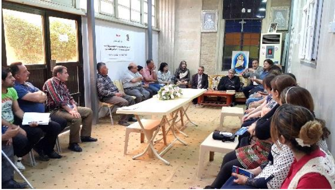
A small hall for faithful beside the temple